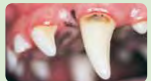
(2) Gingivitis – with early calculus