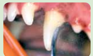
Removing the calculus using an ultrasonic scaler, followed by polishing the teeth is a very effective form of treatment