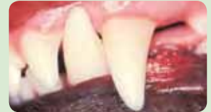
(1) Healthy mouth